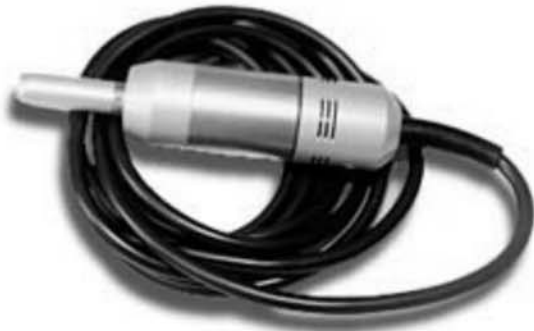
P-MM-E 35,000 RPM MICROMOTOR W/ CORD