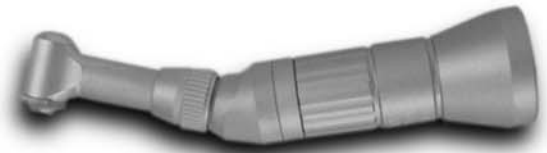
P-A4 F. G. CONTRA ANGLE FOR MICROMOTOR