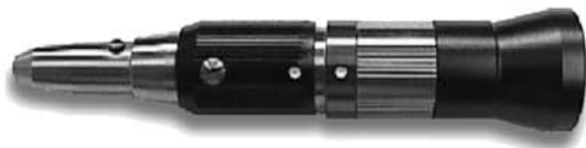
P-SH-A 1:1 STRAIGHT HANDPIECE