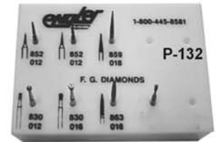
P-132 DIAMOND BURS - KIT OF 7