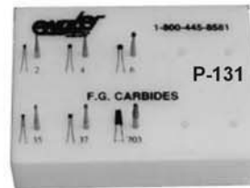
P-131 CARBIDE BURS - KIT OF 6