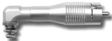
P-A1-B PROPHY ANGLE (SEALED BEARINGS)