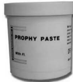
P-112 POLISHING PASTE (8 oz. JAR)